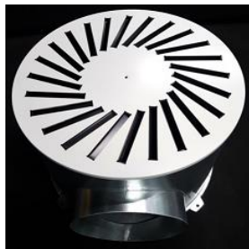
ADSW-C-24 / 600mm Dia Circular Swirl c/w 24 Adjustable Blades RAL9010